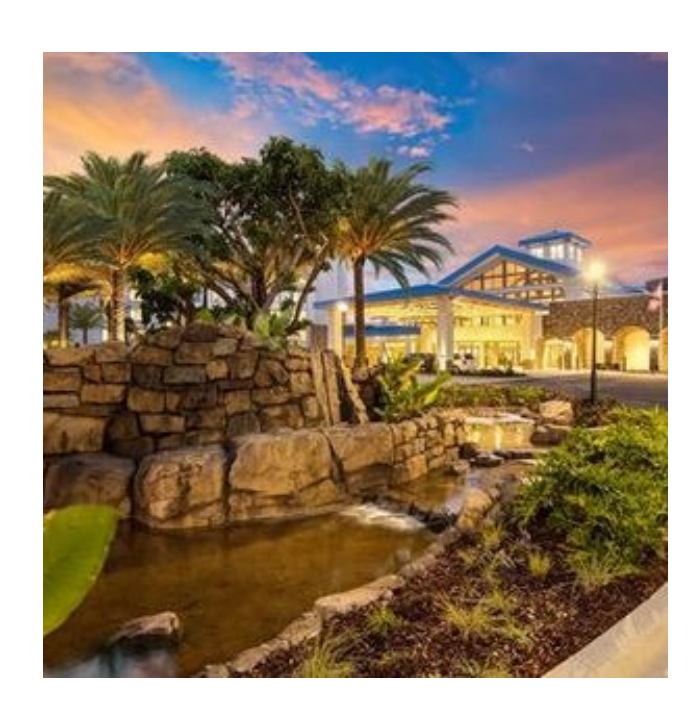
Loews Sapphire Falls Resort - Orlando, Florida January 13, 2018